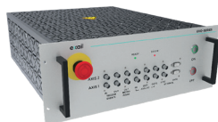
4U - 19"