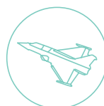
Airborne sensors: • Optronic • Radar • EM